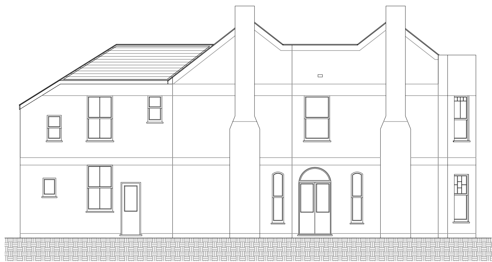
5 Proposed Side Elevation