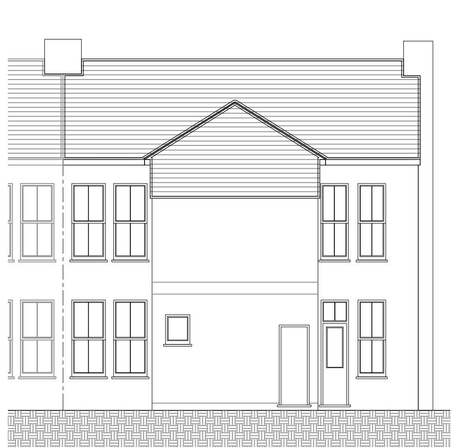
4 Proposed Rear Elevation