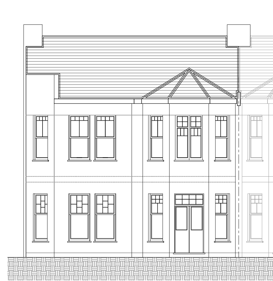
3 Proposed Front Elevation